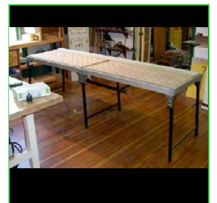
Two 1080 MFT's joined together end to end to form a long work surface